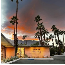
The Shops at Thirteen Forty-Five – a must stop!