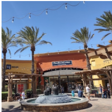
Desert Hills Outlet Mall and Cabazon Outlets (30 minutes from Palm Springs)

There are so many hotels to choose from, from small historic inns in the heart of Downtown Palm Springs to the vast resorts of Indian Wells and Palm Desert, with rooms at every price point. My recent favorites include La Serena Villas , L'Horizon , and The Parker , but I've had so many other excellent stays in Palm Springs at other hotels over the years. Depending on your budget and neighborhood choice, you're sure to find a great stay option. Palm Springs also has some fantastic hotels that cater specifically to the LGBTQ+ community, as well. I'm happy to narrow a list with you depending on what kind of experience you are seeking; just connect with me.