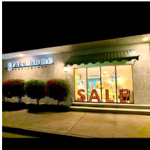
Grace Home Furnishings