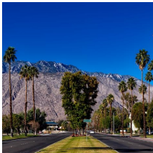
Other shopping on North Palm Canyon Drive