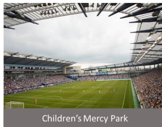
Children's Mercy Park