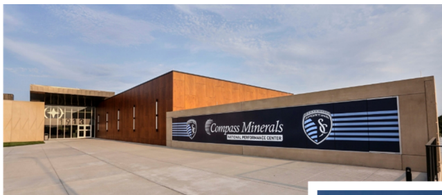
Compass Minerals National Performance Center

Village West is located approximately 15 miles west of Downtown Kansas City. Development in this area began with the opening of the Kansas Speedway in 2001, and the area has been growing since. Village West is now one of the top tourist destinations in the state of Kansas, featuring the leisure demand generators shown below, among others.