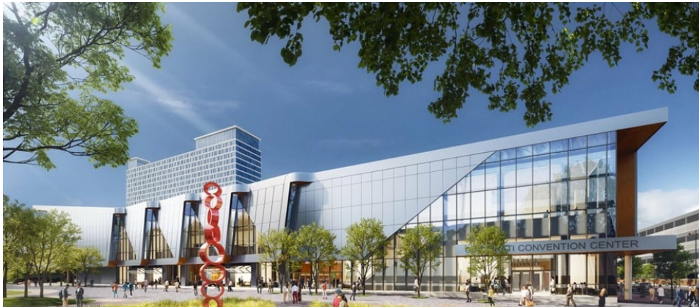
DECC Renovation Renderings

This project is expected to significantly boost the Cincinnati lodging market by attracting larger conferences and events. With enhanced facilities and a more modern convention space, the renovated DECC is anticipated to be more competitive with the other convention centers in the Midwest. Furthermore, the development of the convention headquarters hotel should create sufficient lodging supply to meet the higher levels of convention demand anticipated.