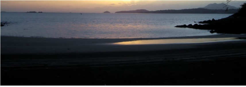
Sunset view from Panama City, Panama, one of Latin America's up-and-coming medical tourism markets

Many international healthcare facilities, some in developing nations, have obtained accreditation for high-quality facilities that meet or exceed those available in a foreign patient's home country. For instance, Hospital Punta Pacífica in Panama has partnered with Johns Hopkins Medicine International to provide world-renowned collaborative research and medical services for the benefit of patients. Colombia is gaining worldwide prominence in cardiovascular and transplant surgery and often receives patients from abroad who cannot obtain such quality care within their home countries.