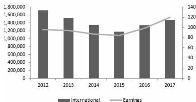
VISTATION - KENYA, 2012-2017