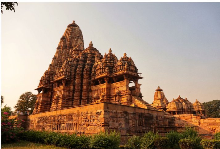
Khajuraho, Madhya Pradesh, India

World Heritage Day, also known as the International Day for Monuments and Sites, is celebrated on the 18th of April every year to raise awareness about the importance of preserving our heritage and culture. Several events and exhibitions were held across India last week to commemorate the occasion. With 40 UNESCO World Heritage Sites and another 49 on the tentative list, India ranks sixth in the world in terms of the number of UNESCO sites. In addition to these, the country has nearly 3,700 centrally protected monuments/sites under the ASI, which showcase India's fascinating history, rich heritage, and culture, attracting a large number of domestic and international visitors each year.