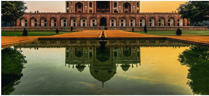
Humayun's Tomb, Delhi, India

Over the years, the Indian government and other tourism stakeholders have worked hard to propel the growth of heritage tourism. Effective marketing campaigns have been implemented and activities ranging from light & sound shows, heritage/cultural walks, and cycle tours to culinary events and festivals have been introduced at the various heritage destinations to attract tourists. However, there is still much more that can be done, especially now that international travel is making its long-awaited comeback.