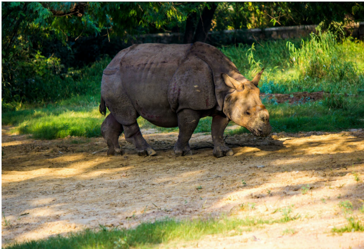
Kaziranga National Park, Assam

Northeast India, comprising eight states, is a stunning combination of majestic mountains, lush green valleys, scenic landscapes, rich biodiversity, and historical sites. Rich in flora and fauna, as well as diverse culture and traditions, each state – Arunachal Pradesh, Assam, Manipur, Meghalaya, Mizoram, Nagaland, Sikkim, and Tripura – offers a unique experience to travelers ranging from heritage and cultural tourism to wildlife and adventure tourism. The region is also home to some world-renowned tourist attractions. Manipur, for instance, has the world's only floating national park, while Meghalaya is known for its legendary caves, some of which are among the longest in the world and Assam is home to several tea estates and the Kaziranga National Park, a UNESCO World Heritage Site.