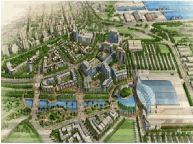
Rendering of the Puerto Rico Convention Center District 2

The sluggish entry of new lodging supply into the San Juan market has allowed occupancies to remain strong and average rates to increase tremendously. Historically, occupancy levels in San Juan have kept well above those in the continental United States. In 2007, occupancy is estimated to decrease slightly, as the market has experience an increase in room availability following major renovations of various hotels in 2006. The following chart illustrates occupancy trends in the San Juan market compared to those in the United States: