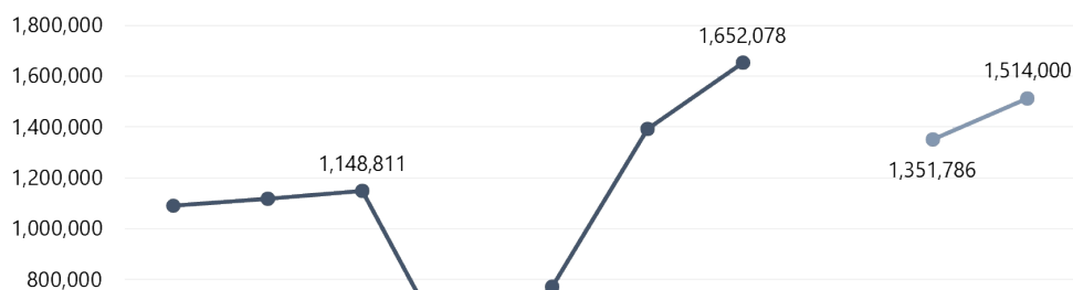
LIR Passenger Traffic Far Surpasses 2019 Level and Continues to Grow