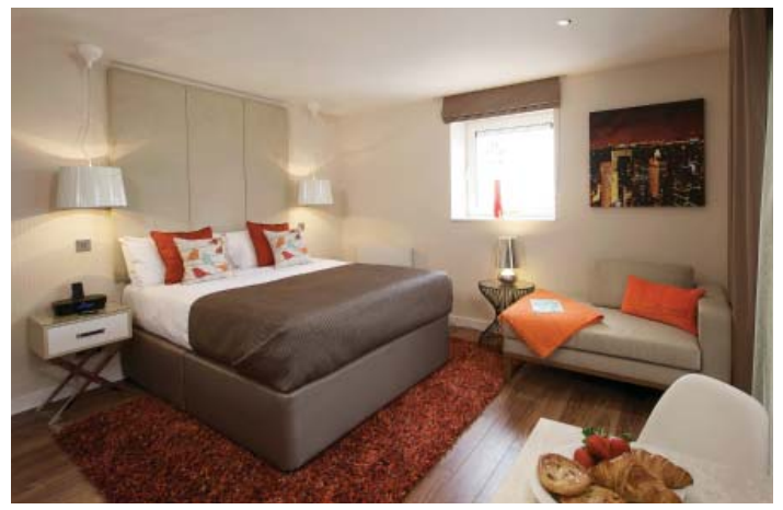
FRASER PLACE CANARY WHARF

Secondly, distance plays an important role in the slower growth of the serviced apartment market. In the USA, the distance between the East and West Coast is about 4,800 km, which equates to a five-hour plane ride. This makes it almost impossible to fly home to the East Coast for the weekend while working on a project in California. Flying from London to Berlin, however, is only about 1,000 km with a flight time of 1.5 hours and can easily be done in a day. Hence, the trend for individuals working on projects in Europe is to return home more frequently, whereas business people employed on projects in the USA have a harder